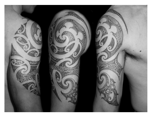
Ta Moko is a Maori body art practice which shows that the wearer has status within the community. Ta Moko can also tell the story of the wearer's family heritage.

Since newsreaders, sitcom stars and upmarket shoppers began to draw roses, skulls, and Latin phrases on their flesh, the power of ink has diminished. The deviant nature of the tattoo has faded like, well, a tattoo.