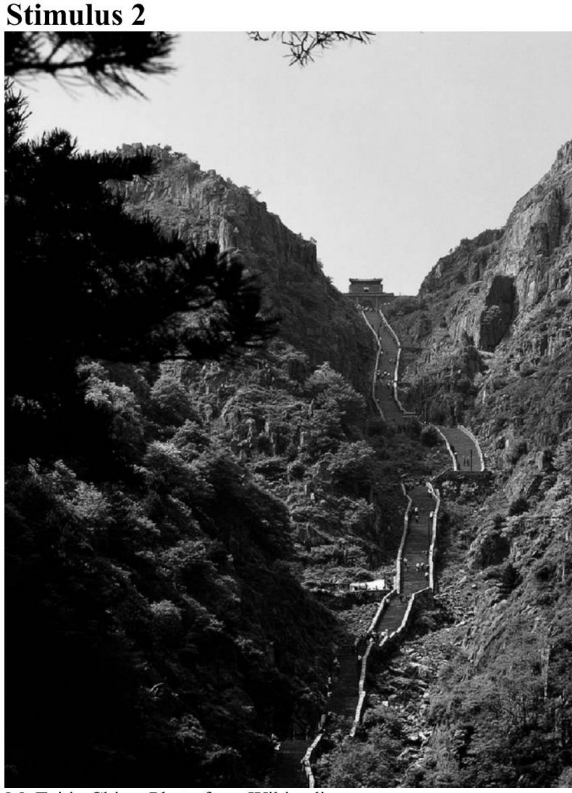
Mt Tai in China.

'A dream must have a deadline, otherwise it's only a fantasy.'