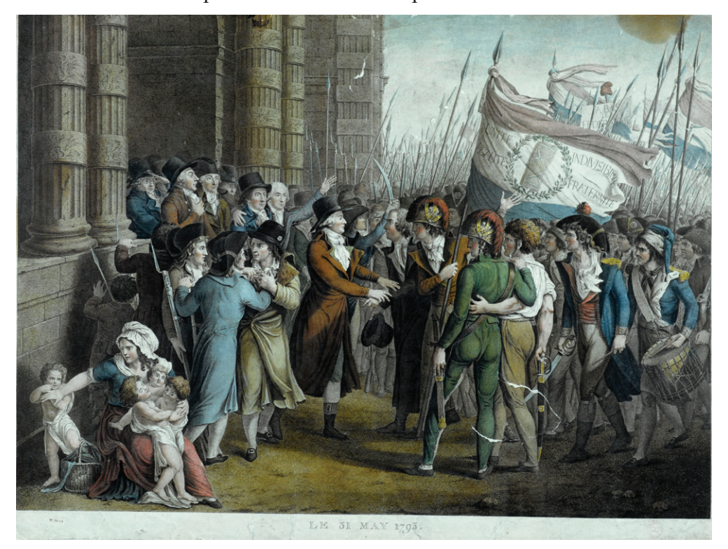
Source: Jean Joseph Francois Tassaert, May 31, 1793 , 1796–1797, Musée Carnavalet, Histoire de Paris, G.23669, https://www.parismuseescollections.paris.fr/fr/musee-carnavalet/oeuvres/le-31-may-1793-0#infos-principales.

The print below, created in 1796–1797, depicts the uprising of Parisian sans-culottes from 31 May to 2 June 1793. The scene takes place in front of the Deputies Chamber in the Tuileries.