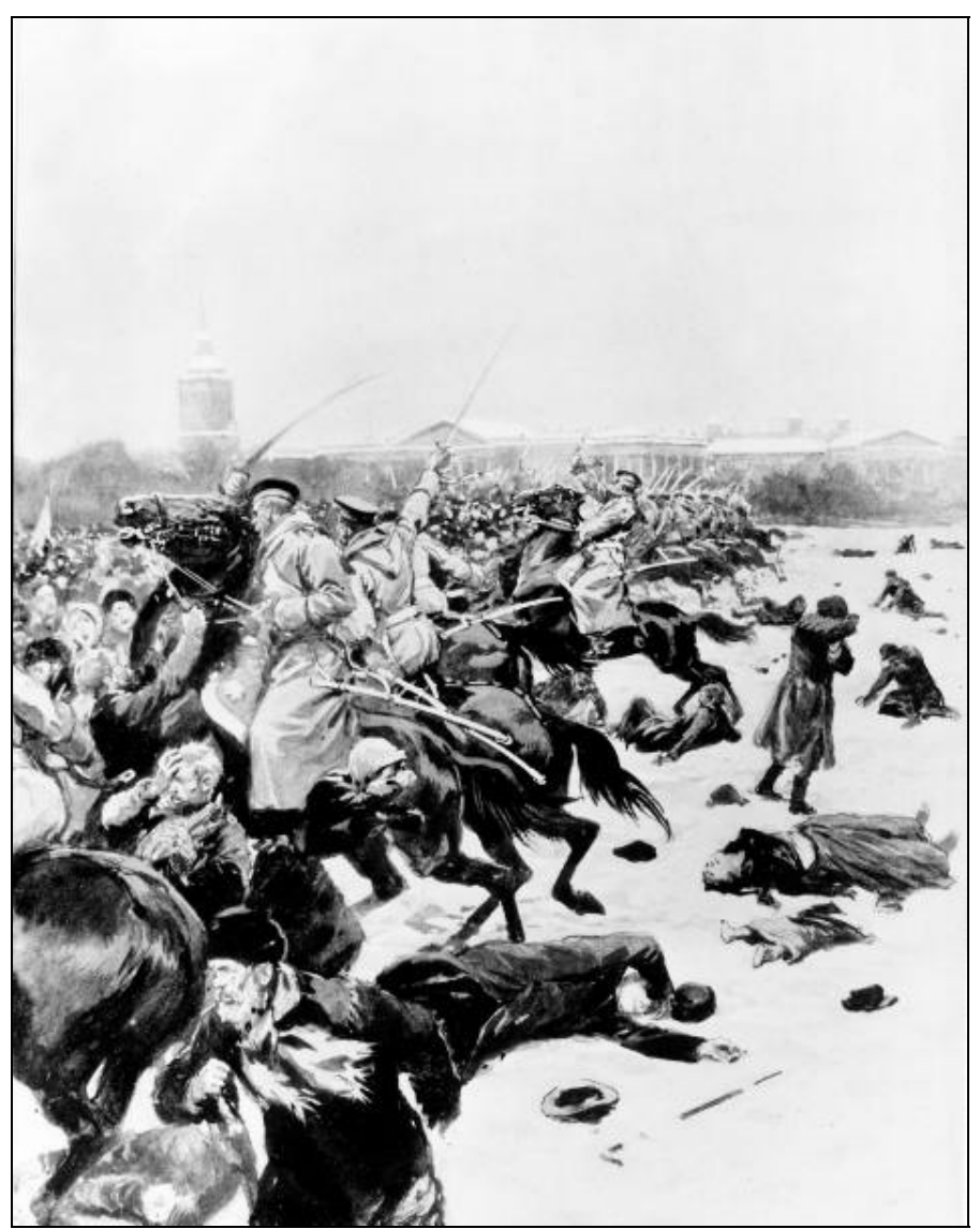
'Bloody Sunday 1905' (artist unknown, Wikimedia Commons)

1a. Identify two groups shown in the representation of Bloody Sunday.