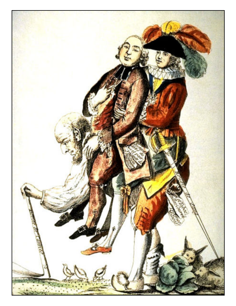
'The Third Estate carrying the Clergy and the Nobility on its back' (artist unknown, 1790s)

1a. Identify two different groups symbolised by the figures in the representation.