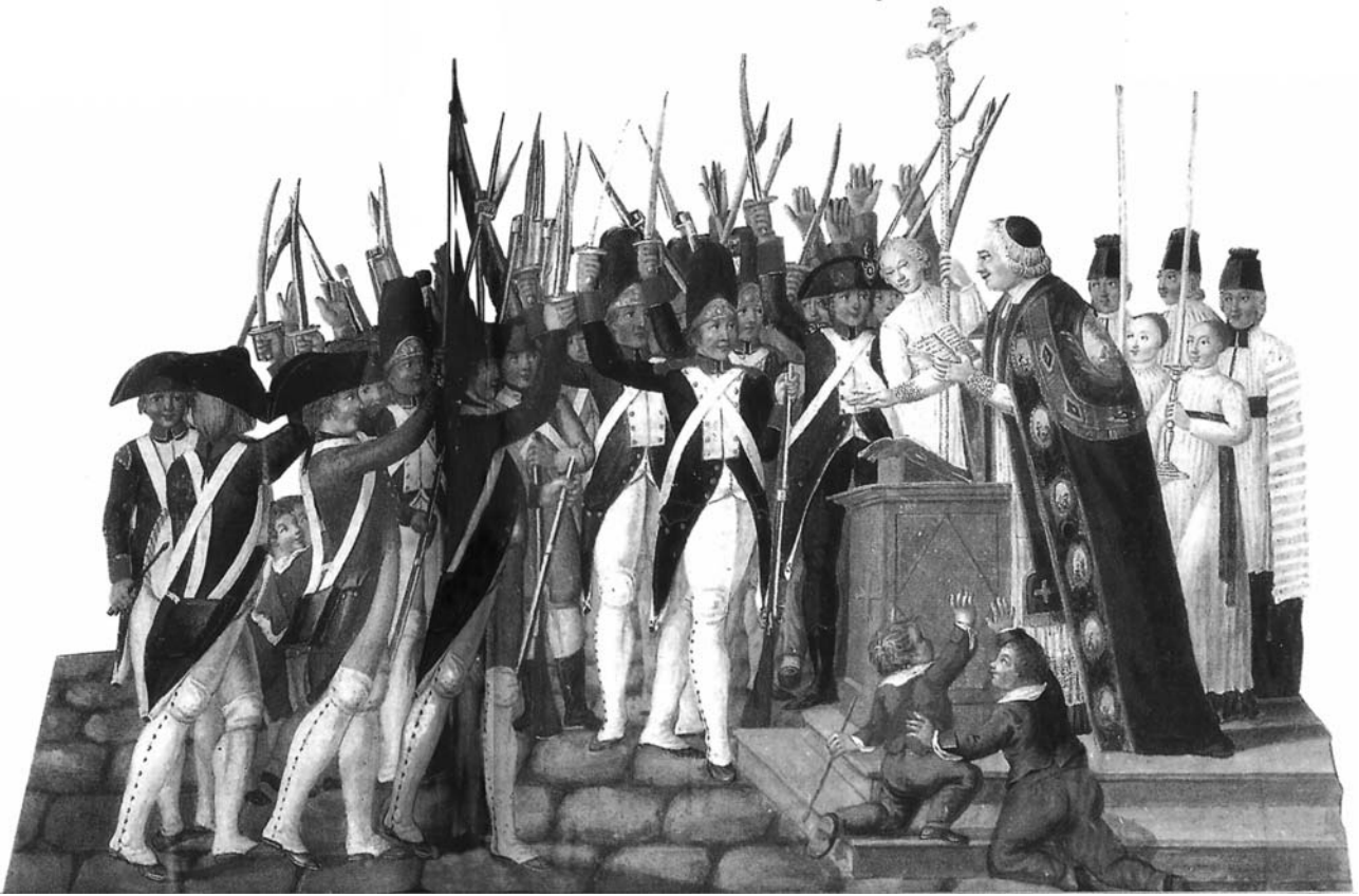
The patriotic oath of the National Guard at the Fête de la Fédération July 1792, Richard Cobb, Voices of the French Revolution , pp. 146–147

a. Identify two groups of people represented in the drawing.