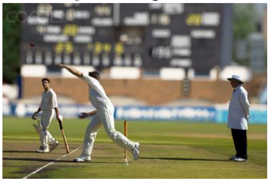
The image below relates to Questions 4 and 5.

A cricket bowler preparing to run in and deliver the ball would have a focus which is